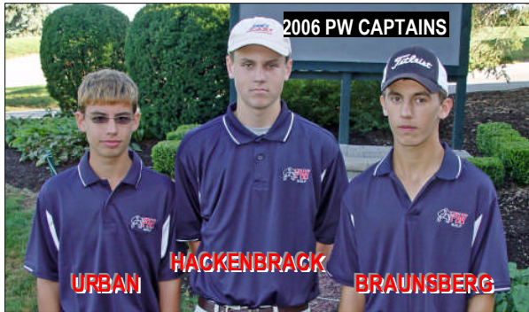
2006 PW CAPTAINS